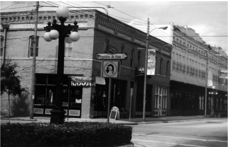
Intersection of República de Cuba Street and Seventh Avenue in Ybor City