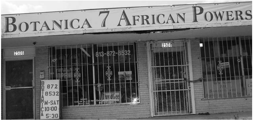
Botánicas: Stores that sell religious articles associated with Cuban religions of African origin