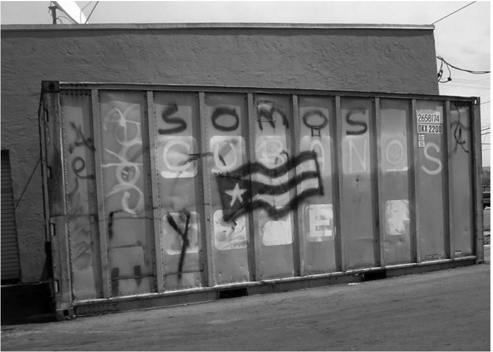
Patriotic Cuban graffiti in alley in West Tampa