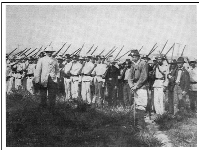
Training of Mambi soldiers in Tampa. 1898