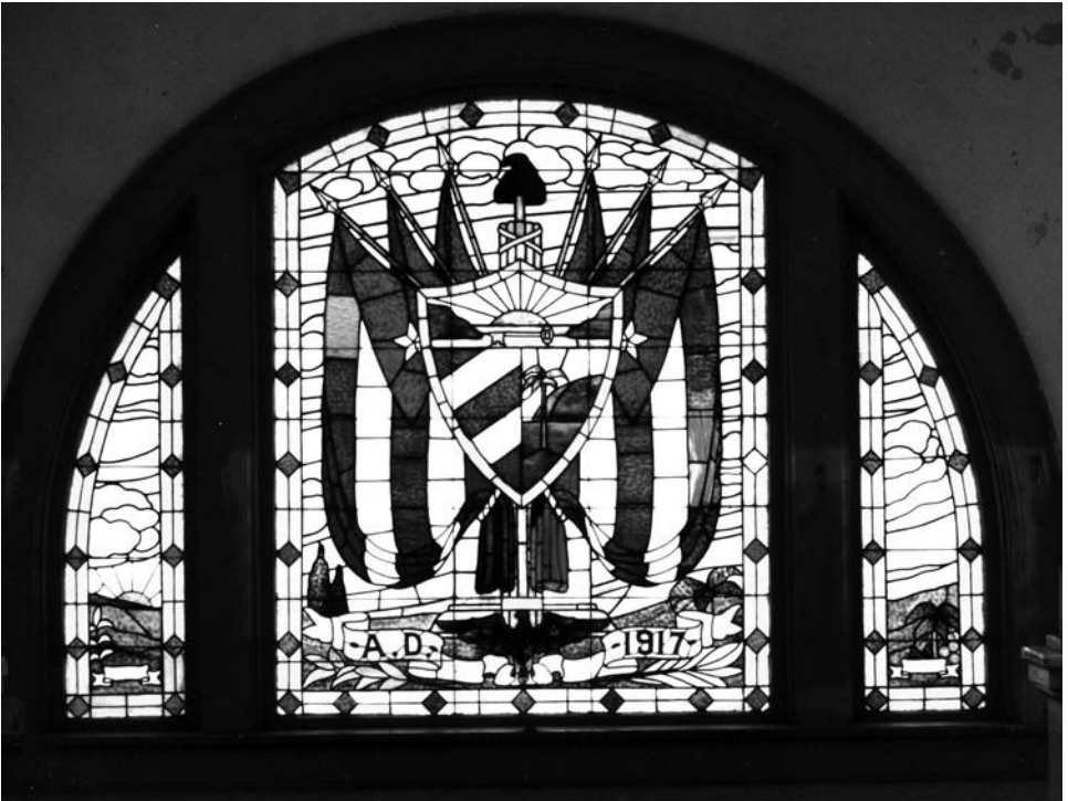
Wartime coat of arms in Circulo Cubano window