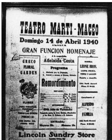
Marti-Maceo theater notice. 1940