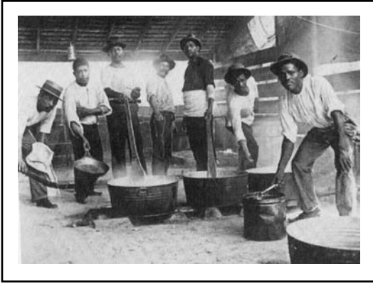
Tampa Cuban cigarmakers on strike. 1899