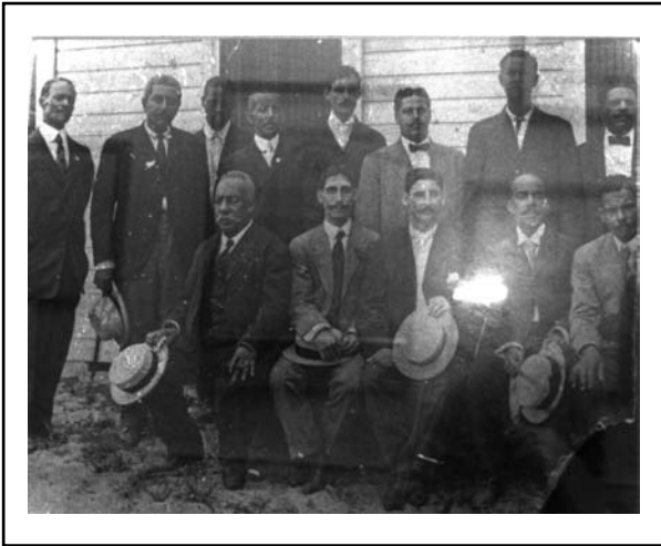
Founders of La Unión Martí Maceo Society. 1904