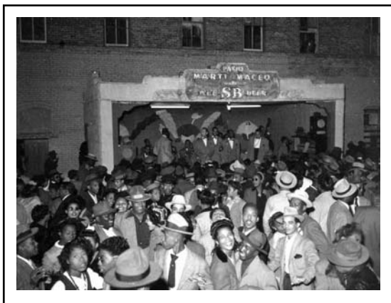
African American dance in La Unión Martí-Maceo