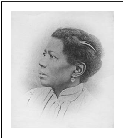
Dignified Afro-Cuban Woman