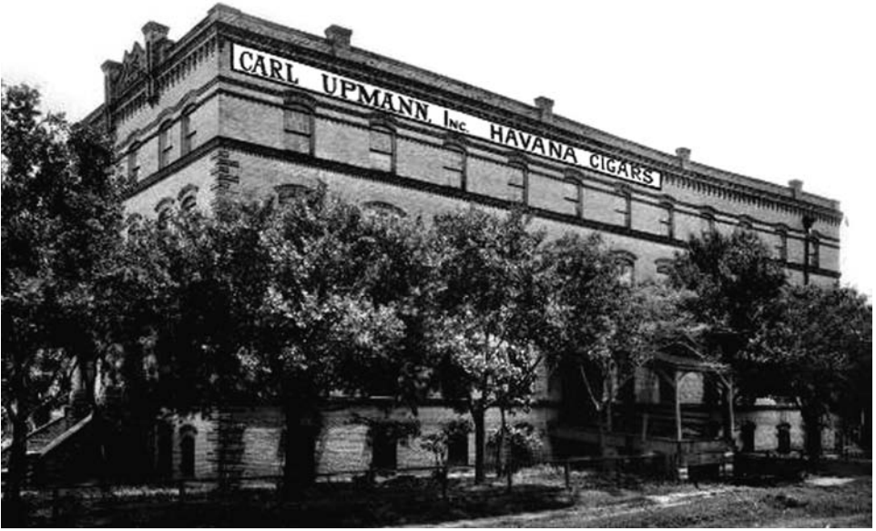
Carl Upmann, Inc. cigar factory in Tampa