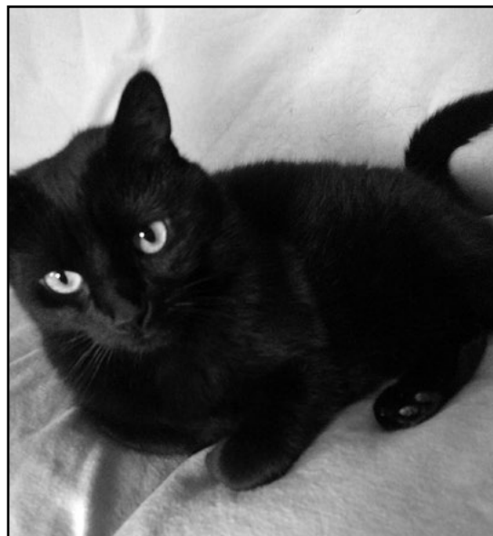
▲ Misty is a sweet and dainty 2-year-old girl who is on a special diet for a sensitive stomach. She was abandoned in the winter and left to freeze, but was thankfully rescued!