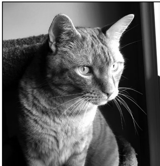
▲ Memphis is a beautiful orange boy who is a hearty 14+ pounds! He is positive for FIV, but is in excellent health and expected to do great.

Don't be negative about our positive diagnoses! We are great cats!