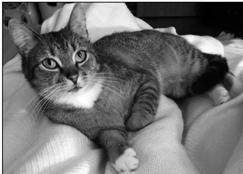
▲ Tasha is 2 years old and has beautiful caramel-colored fur like an Abyssinian. She was abandoned at an apartment complex and was rescued from under a dumpster with her litter of kittens. She has FIV but doesn't let that stop her winning personality from shining through.