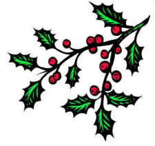
Card front (folded)