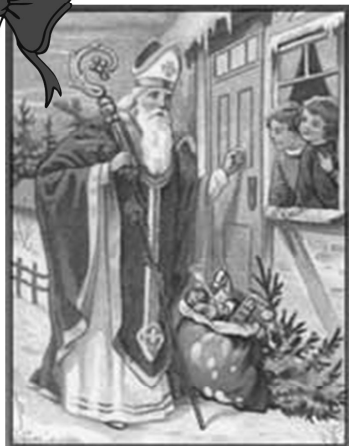
The Feast of Saint Nicholas is December 6th.

Children: come dressed in pajamas and bring a pillow or a blanket to sit on as we enjoy stories, songs, crafts, hot chocolate and snacks (any donations of baked goods would be greatly appreciated!) to celebrate the Feast of Saint Nicholas