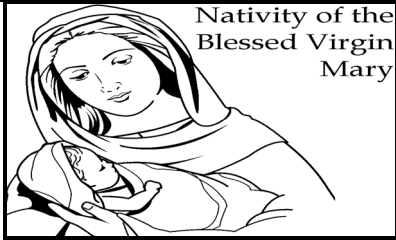
Nativity of the Blessed Virgin Mary

Sunday: Ez 33:7-9; Ps 95:1-2, 6-9; Rom 13:8-10; Mt 18:15-20 Monday: Mi 5:1-4a or Rom 8:28-30; Ps 13:6; Mt 1:1-16, 18-23 [18-23] Tuesday: 1 Cor 6:1-11; Ps 149:1b-6a, 9b; Lk 6:12-19 Wednesday: 1 Cor 7:25-31; Ps 45:11-12, 14-17; Lk 6:20-26 Thursday: 1 Cor 8:1b-7, 11-13; Ps 139:1b-3, 13- 14ab, 23-24; Lk 6:27-38 Friday: 1 Cor 9:16-19, 22b-27; Ps 84:3-6, 12; Lk 6:39-42 Saturday: 1 Cor 10:14-22; Ps 116:12-13, 17-18; Lk 6:43-49