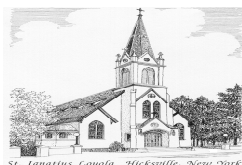
St. Ignatius Loyola Hicksville, New York

Please place in weekly collection basket or drop off at the Parish Office.