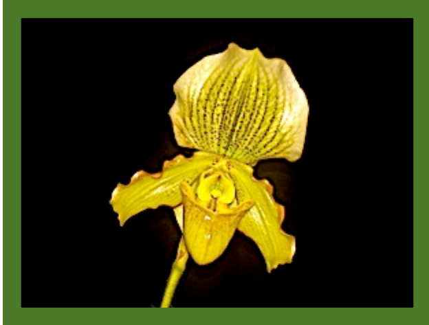
Paph. Fair Yerba Grown by B. Ellingsen