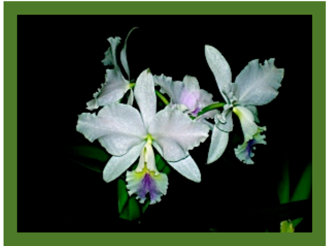
C. Big Ben 'Blue Mountain' Grown by J. Capone