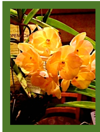
Ascda. Crown Fox 'Butterball' Grown by B. Ellingsen