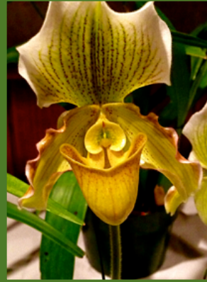
Paph. Fair Yerba Grown by B. Ellingsen