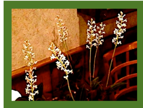
Ludisia discolor *Special Rosette* Grown by G&H Zona