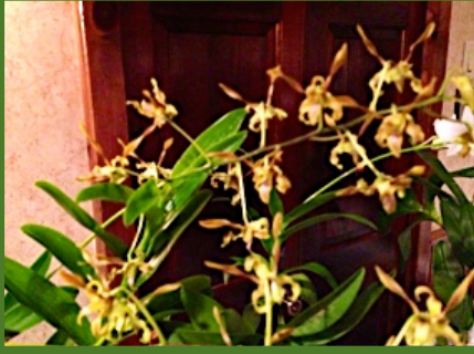
Den. strebloceras 'Tangerine Beauty' Grown by S. DelGuerico