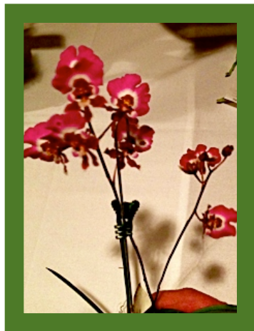
Unknown Tolumnia Grown by M. Penso