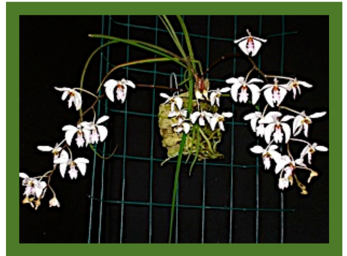
Holcolglossum wangii Grown by R. Ference