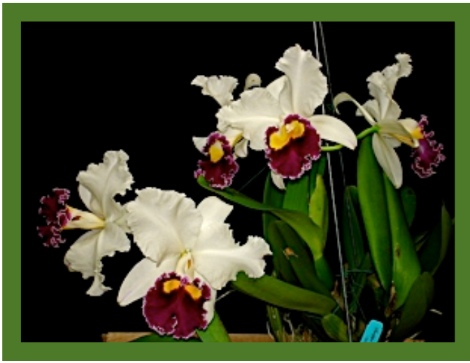
Lc. Sheila Lauterbach 'Equilab' FCC/AOS Grown by R. Ference