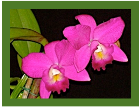
Lc. Mini Purple 'Candy Tuff' Grown by R. Ference