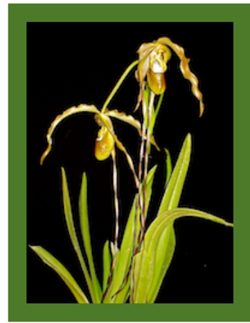
Phrag. Grande 4N x caudatum Grown by A. Fontaine