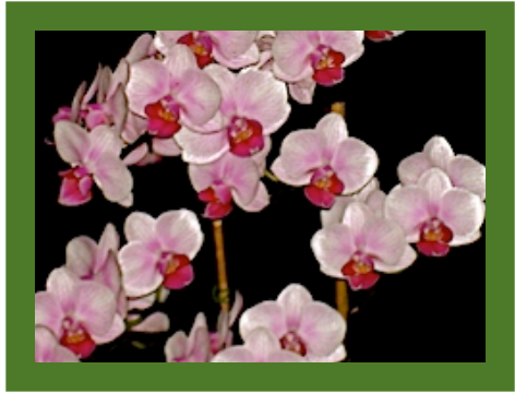
Dtps. Sogo Yenlin Grown by A. Fontaine