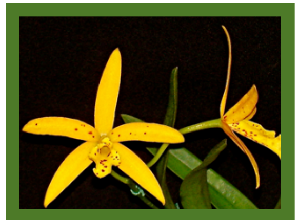
Bc. Rustic Spots Grown by G. Bollenbach