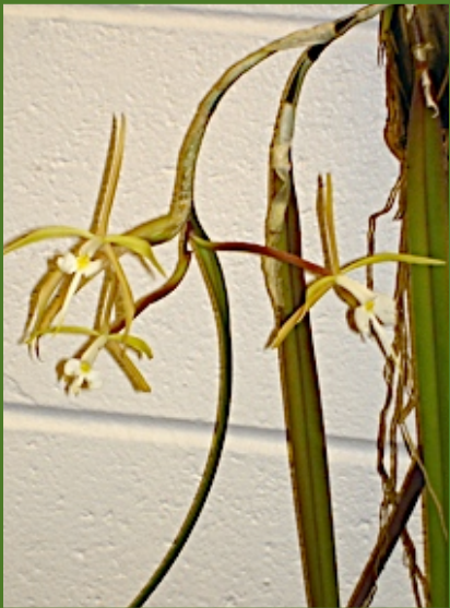
Epi. parkinsonianum Grown by A. Fontaine