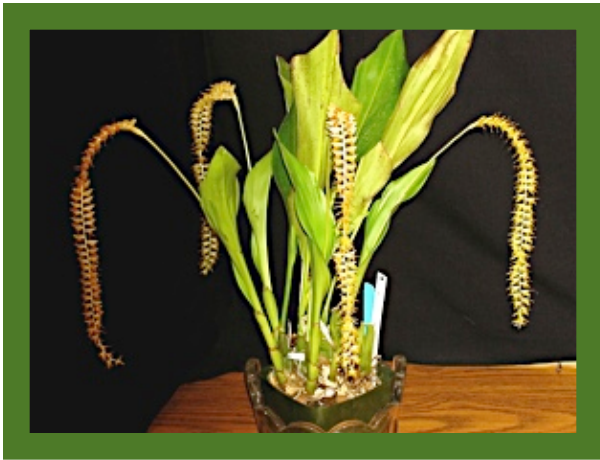
Dendro. magnum Grown by P. Cascioli