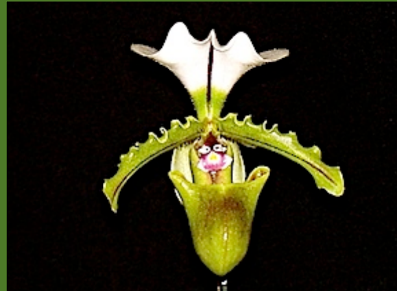
Paph. spicerianum 'Hiao Hua' Grown by C. Connolly