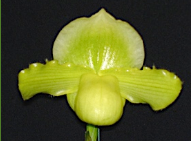
Paph. Avalon Love Stone Grown by: A. Fontaine