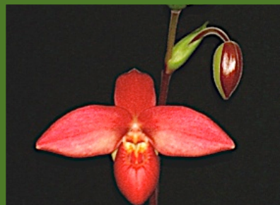
Phrag. Fox Valley 'Fire Ball' Grown by: B. Class