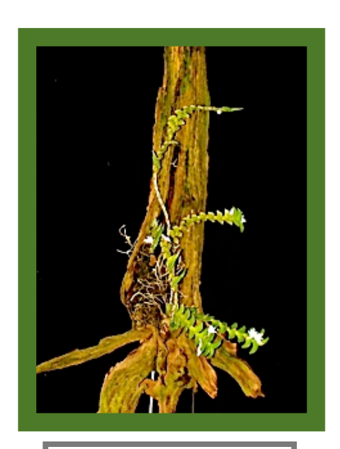
Angem. distichum Grown by A. Fontaine