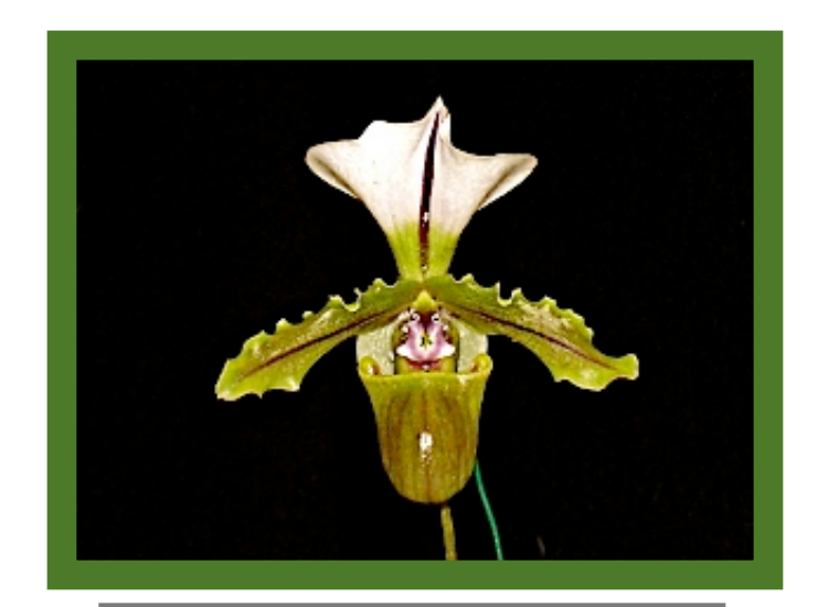
Paph. spicerianum 'Hiao Hua' x sib. Grown by C. Connolly