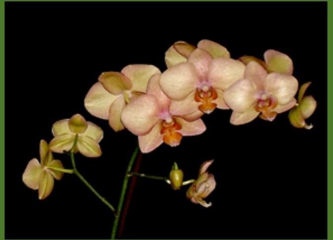
Phal. Baldan's Venetian Peach 'Peach Delight' Grown by A. Fontaine