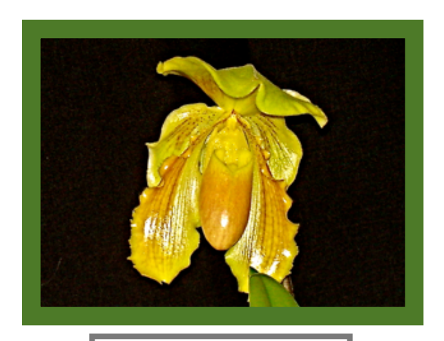
Paph. Val-Lime 'Val' Grown by A. Fontaine