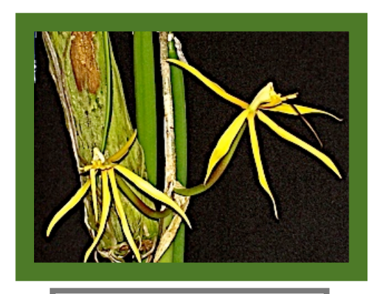
Epi. parkinsonianum Grown by A. Fontaine