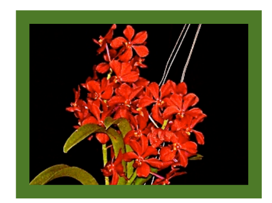
Vasco. Crown Fox 'Red Gems' x Ascda. Peggy Foo Grown by A. Fontaine