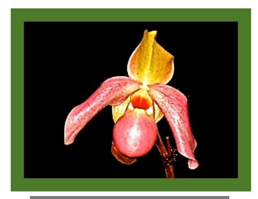
Paph. moquettianum x delanatii Grown by R. Michalenko