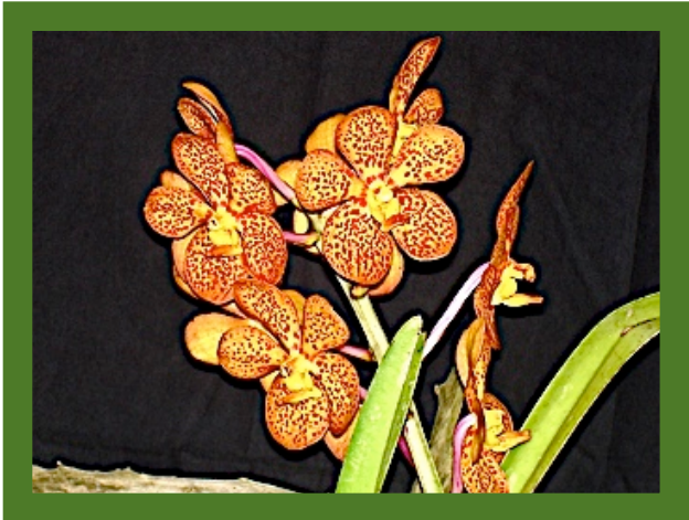
V. Bogus Sunspots Grown by A. Fontaine