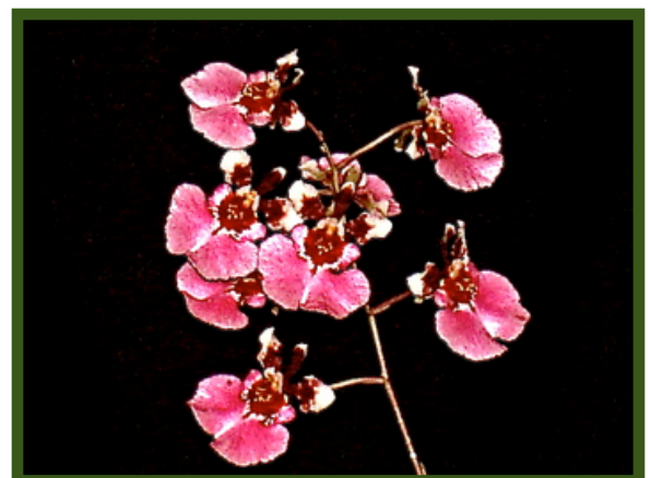
Tolumnia Red Barry