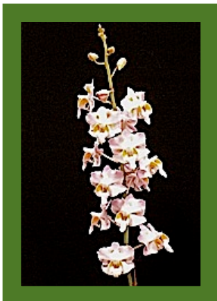
Dor. pulcherrima var. champorensis Grown by A. Fontaine