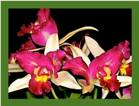
Blc. Haw Yuan Beauty 'Hong' Grown by A. Fontaine