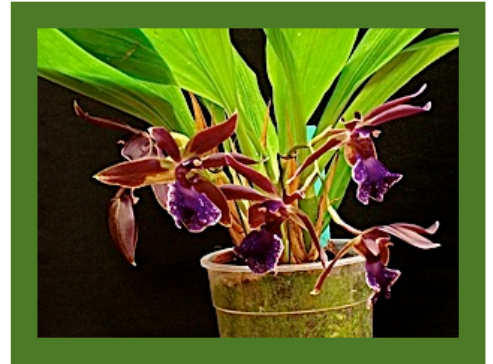
Bolopetalum Midnight Blue 'Cardinal's Roost' Grown by B. Ellingsen