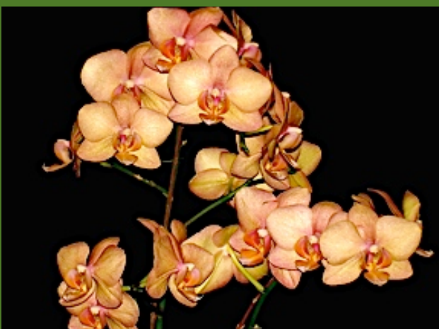
Phal. Hybrid Grown by A. Fontaine