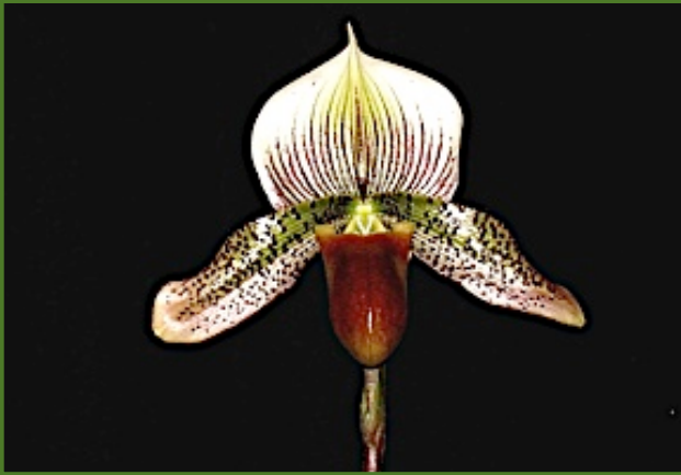
Paph. Standard Flight x mastersianum Grown by R. Michelanko