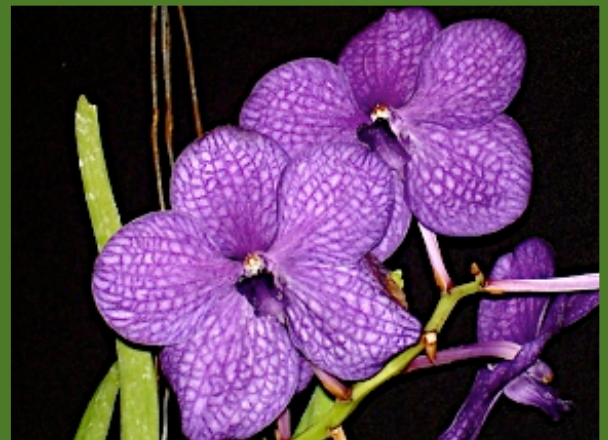
Ascda. Princess Mikasa 'Blue' Grown by A. Fontaine