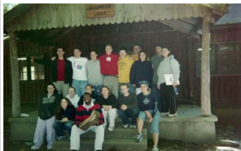
The Group Of Circle Kers Who Attended Leaderscape

Overall, I enjoyed this weekend. I learned how to become a better person and a better leader not only in my club, but also in my every day life. I also made new friends from out of state, and really got to experience the three pillars of Circle K International, "Service, Leadership, and Fellowship."