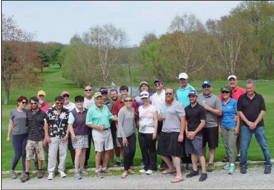
The golfers in the 2018 Hidden Valley Closed Golf Classic – Don't miss this fun event!

Where: Hidden Acres Golf Course (rain or shine)