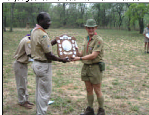
The Patrol Leader of the Avondale Troop receiving his trophy.