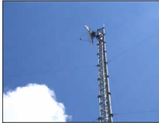
Sir Edmund Hillary – or rather Paul at the top of the radio mast.

We did not follow the same route back, but instead took an alternative route up the Mtshebezi escarpment. We had trouble keeping to the path and all of us got stung by stinging nettles, some more severely than others! After finding the path we continued along it until we went to a cave, the entrance of it completely almost completely covered by a massive boulder, making it invisible until you are right at it. We found around 20 grain bones inside the cave, along with a couple of broken ones and lots of remains of woodcarvings everywhere. We then stopped on a huge rock overlooking the Mtshebezi Valley, once again amazed by the natural beauty. We stayed here for a while, so I lapped up some rays and tanned for a while.