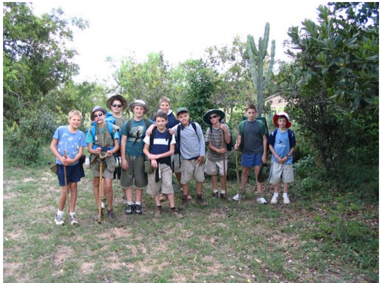
February Hike - Ghali - a group picture taken on Ghali from where the hike started

The hike there was very stress free because it was flat land all the way. There was a bit of bush - whacking but it added to our hiking spirit. What also made the hike so pleasant was the lovely cool breeze. We climbed Shumba - Shaba to the top and played in the pools. After that it was all downhill to Gordon Park. We were back at the park at 10.00 am for tea. That afternoon we went caving and climbing for a while and others shot the pellet guns or just ate. Then the whole lot of us decided we were going to push the scotch cart to the showers and back, this turned into a very amusing event! It was up hill to