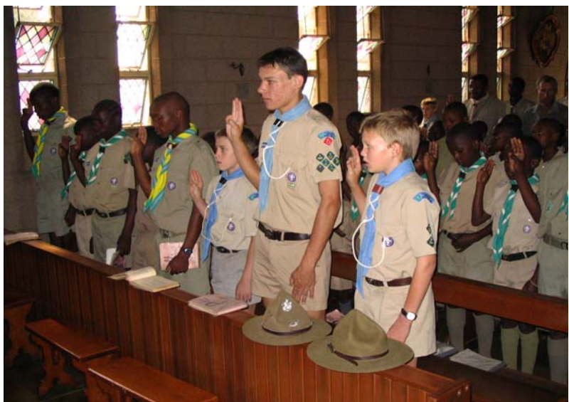
St George's Day Service at St Mary's Cathedral - Scouts reaffirming the Scout Promise