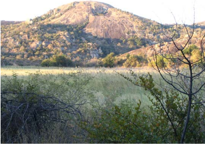
The majestic Shumba Shaba