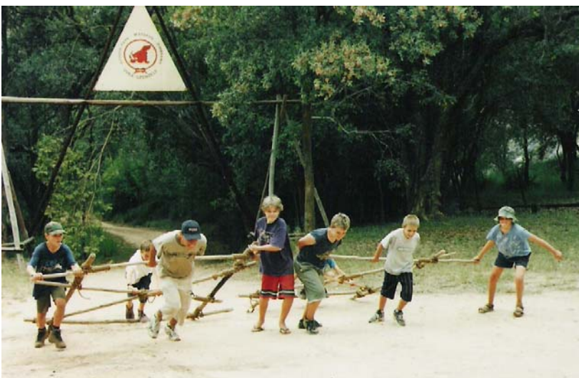
The Chariot Race. The Scouts constructed scout trestles and then had races - to see which chariot did not fall apart!

Matopos landmarks around us in the distance: Silozwe, Ififi, Pomongwe, World's View, Gulati. What a privilege to be up there on a cool, clear morning having our breath taken away by the beauty.