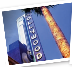
Trip to Los Angeles