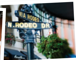
Personal Stylist Consultation and Wardrobe