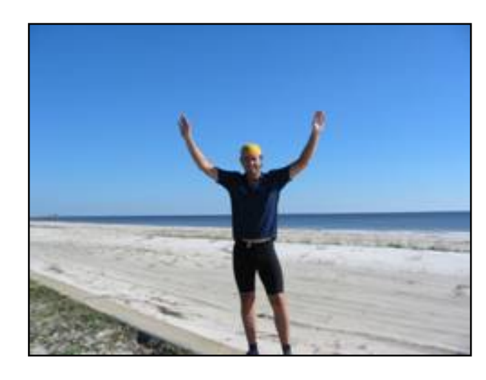
Me at the Gulf of Mexico in Slidell, Louisiana, November 2002

I actually bicycled across the USA all thanks to the freedom my online businesses provide for me!