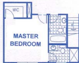
MASTER SUITE OPTION