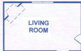
CORNER GAS FIREPLACE OPTION