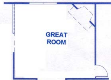
CORNER GAS FIREPLACE OPTION