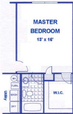
MASTER SUITE OPTION