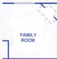
CORNER GAS FIREPLACE OPTION