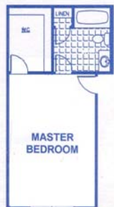
MASTER SUITE OPTION