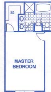
DELUXE MASTER SUITE OPTION