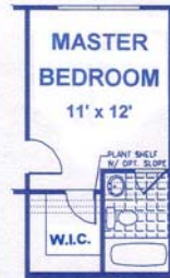
MASTER SUITE OPTION