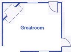
CORNER GAS FIREPLACE OPTION