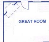
CORNER GAS FIREPLACE OPTION