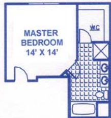
MASTER SUITE OPTION