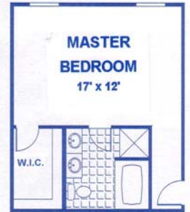
DELUXE MASTER SUITE OPTION