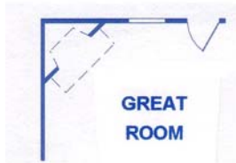
CORNER GAS FIREPLACE OPTION