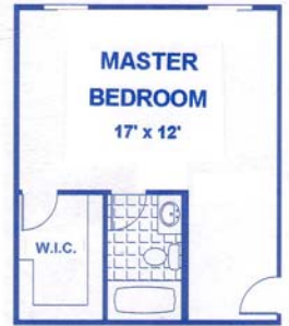
MASTER SUITE OPTION