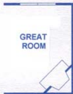
CORNER GAS FIREPLACE OPTION