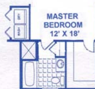
MASTER SUITE OPTION