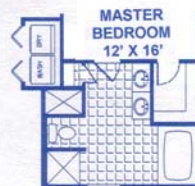
DELUXE MASTER SUITE OPTION