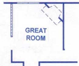
CORNER GAS FIREPLACE OPTION