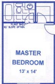
MASTER SUITE OPTION