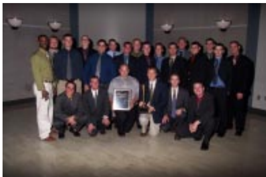
Chapter Brothers celebrate after winning the Dean's Cup at the Greek Banquet.

Delta Sigma Phi, a values-based organization that encourages personal development through the fraternity experience, has grown to become one of the nation's largest fraternities. Our members focus on academic success, being sound in mind and body, campus and civic leadership, and building strong bonds of brotherhood.