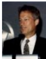
Jim Bouton N.Y. Yankees; Author Ball Four