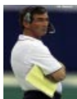
Mike Shanahan Head Coach, Denver Broncos