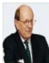
Michael Deaver Deputy Chief of Staff, Reagan Admin.