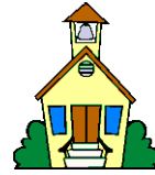
North Tama School

While you were gone, you missed the following assignments: