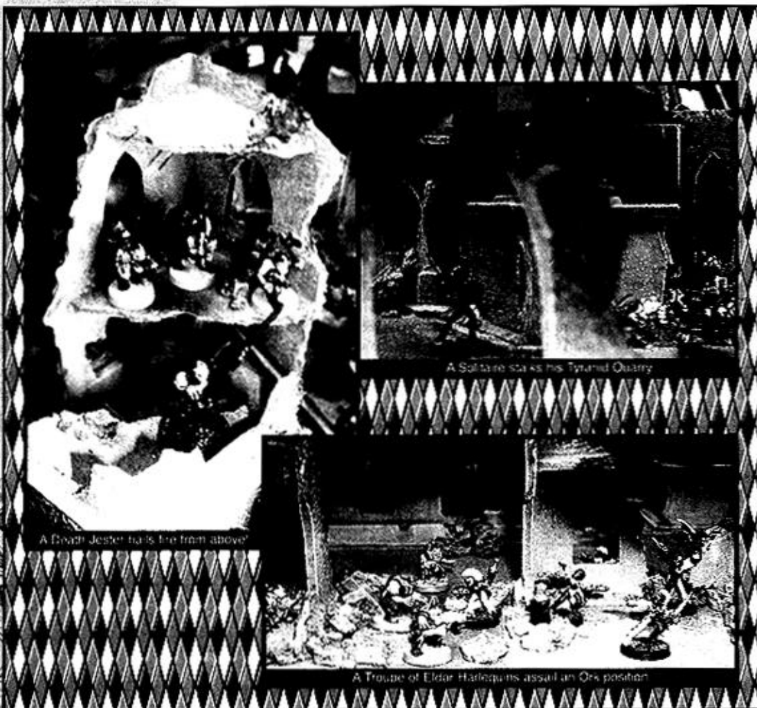
A Gvadr Jester is hit from above