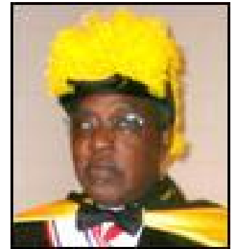
MASTER ARCHDIOCESE OF WASHINGTON DISTRICT