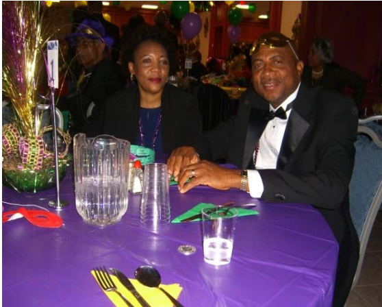
MARDI GRAS PICTURES