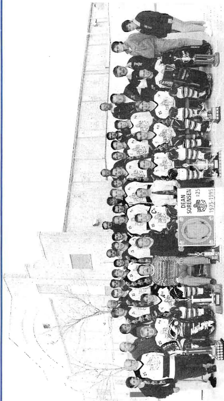
WOODSTOCK NAVY VETS JUNIOR "C" HOCKEY CLUB