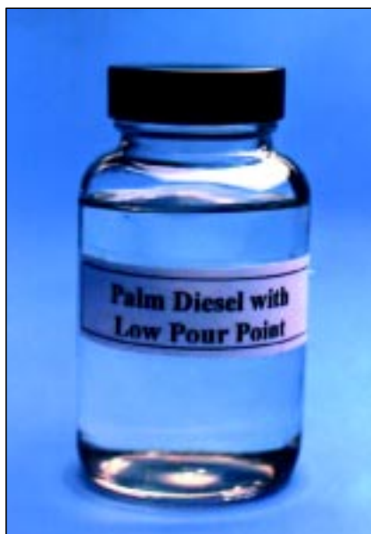
Figure 1. Low pour point palm diesel.