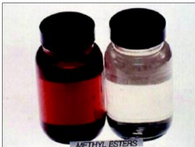
Figure 2. Normal palm diesel (crude/distilled palm oil methyl esters).

esterification process is obviated, an economic advantage. The patented process can also be applied to other raw materials such as crude palm stearin, crude palm olein, crude palm kernel oil and palm kernel products.