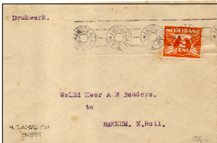
Envelope C(anceled) T(o) O(rder) with AMSTERDAM-ZUID roller cancel

The TERNEUZEN roller cancel was issued to the Terneuzen postoffice on July 28, 1942. In 1942 the name of Neuzen was changed to Terneuzen.