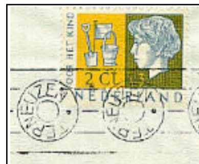
TERNEUZEN (to replace NEUZEN) roller cancel on cut-out with 1953 child welfare stamp.

UTRECHT received a second cancel on February 5, 1940, while there is a note, dated March 16, 1936 in the MofC cancel book indicating that ZALTBOMMEL still was using its roller cancel to cancel savings stamps.