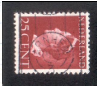
Arnhem 3 ('19) cancel on NVPH # 341

Another story is the “ARNHEM 3” roller cancel. This cancel (which by the way is the only Type VII roller cancel) is known only with '19 in it. Interesting enough, the cancelbook at the Museum for Communication in the Hague shows the cancel as ARNHEM 3 / '17 (not '19, or '15 as is shown on the actual cancel). The cancel was sent to Arnhem on December 10, 1917, and used at the Arnhem (Railway) Station.