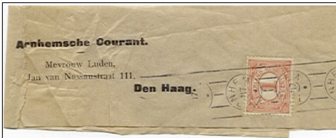
Newspaper wrapper with 'Arnhem ('17)' roller cancel

The typical precancelling procedure was as follows: Sheets of pre-stamped, pre-addressed address labels were