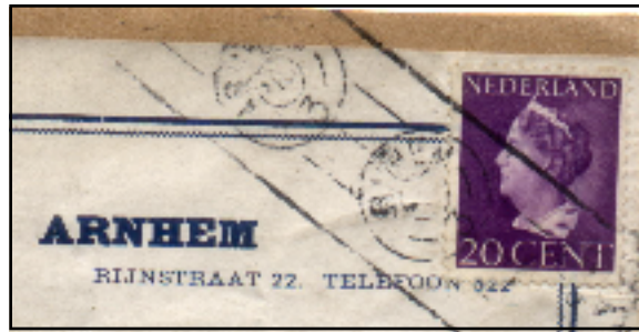
Arnhem 3 ('15?) detail of cover sent 3-17-1947

‘sGRAVENHAGE WO refers to the post office in the Wouwermanstraat in The Hague, which opened in 1924. On May 15, 1941 the ‘sGRAVENHAGE WO roller cancel was sent to the Wouwermanstraat sub-postoffice. This sub-postoffice facilitated an exhibition taking place from March through September 1941 in a nearby location. Why exactly they were using a roller cancel I have not been able to find out.