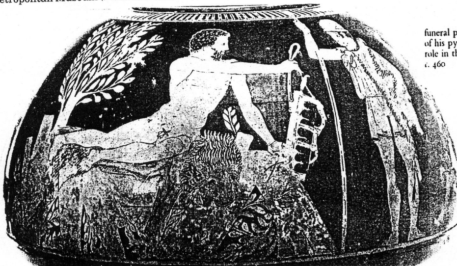
Attic red-figure psykter. Herakles on his funeral pyre. Herakles, lying on his lion-skin on top of his pyre, hands his quiver to Philoktetes, whose role in the Trojan war will be critical because of it. c. 460