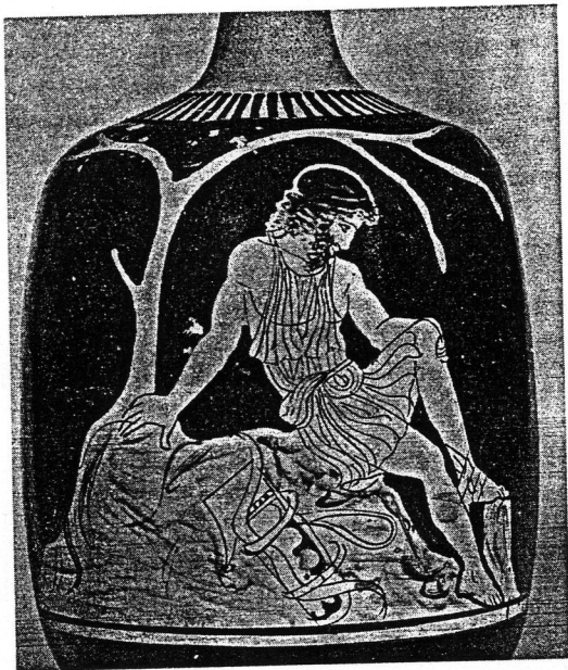
97. Philoktetes on Lemnos, Attic red-figure lekythos, about 430 BC, by a painter near the Eretria Painter, New York, Metropolitan Museum (Fletcher Fund).