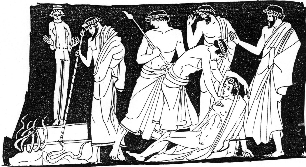
48. Philoktetes bitten by the snake, Attic red-figure stamnos, about 450 BC, by Hermonax, Paris, Louvre.