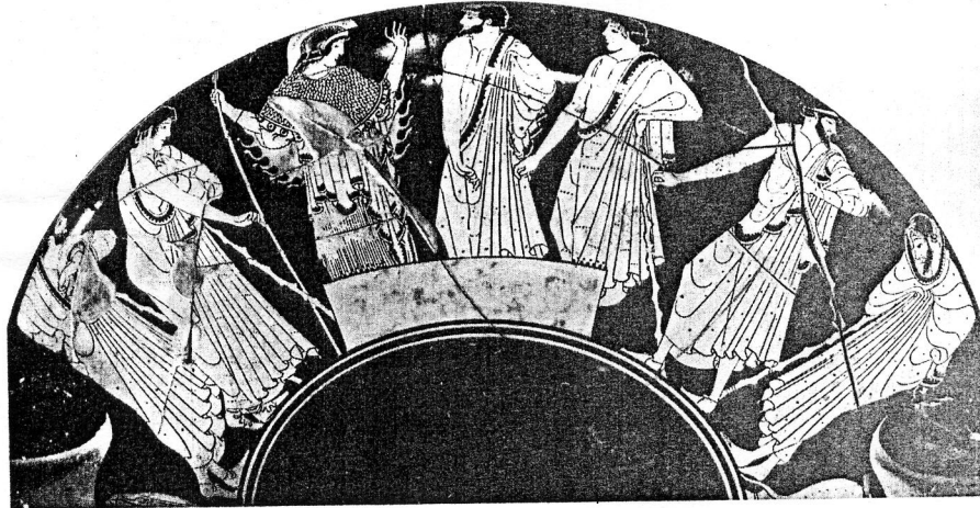
330 (above) Attic red-figure cup from Vulci. Armour of Achilles. A, Ajax and Odysseus are restrained by their comrades as they quarrel over who should have the armour of Achilles. The armour under the handles of the cup and the scene on the other side allow the identification of the specific (as opposed to generic) scene. B, Athena watches as the Achaeans cast their ballots to determine who will have the armour. Odysseus stands to the far left, the winner, while a despondent Ajax stands to the far right. c. 480