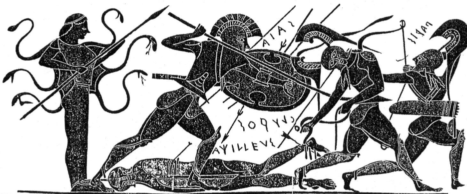
328 (above) Chalcidian amphora. Death of Achilles. Achilles lies dead on the ground with an arrow through his ankle and another in his back. Ajax, guarding the body, spears Glaukos, and Paris, his bow drawn, runs off to the right. Athena in her snaky aegis, stands behind Ajax. c. 540