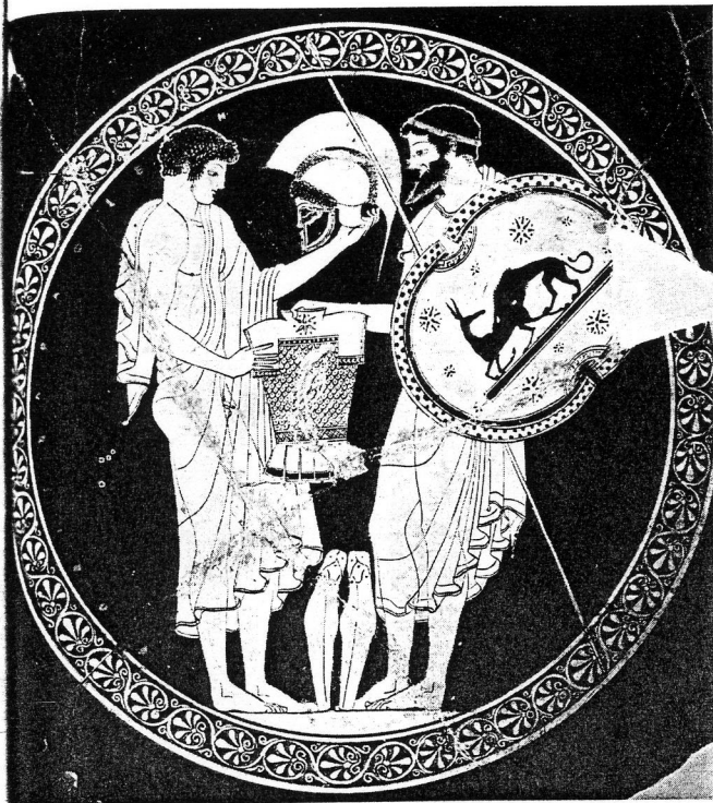
96. Neoptolemus receives the arms of Achilles from Odysseus, Attic red-figure cup interior by Douris (of which the exterior is shown in Figs. 92 and 93).