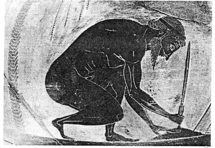
94. Ajax prepares to commit suicide, Attic black-figure amphora, about 540 BC, by Exekias, Boulogne-sur-Mer, Musée des Beaux-Arts et d'Archéologie.