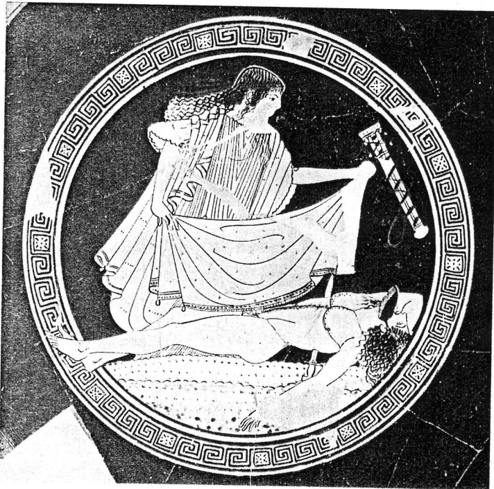
246 Cup by the Brygos Painter. Ajax dead