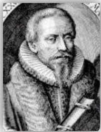
Philipp Nicolai 1556-1608

Building on this foundation of faith in Christ, God gives treasures to the Church to continue the song through the ages. Composers, poets, hymns, and songs are all treasures of the Church, for they sing the faith into our hearts and lives and thus help to make Christ's "Church strong, bold, unified in act and song." Through the years and even in our day, these musical treasures help the singing church sing and confess Christ.