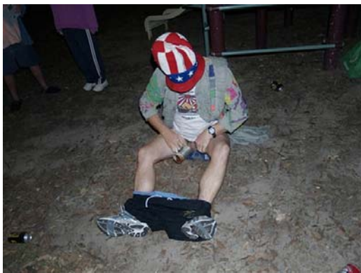
Horror tries water recycling