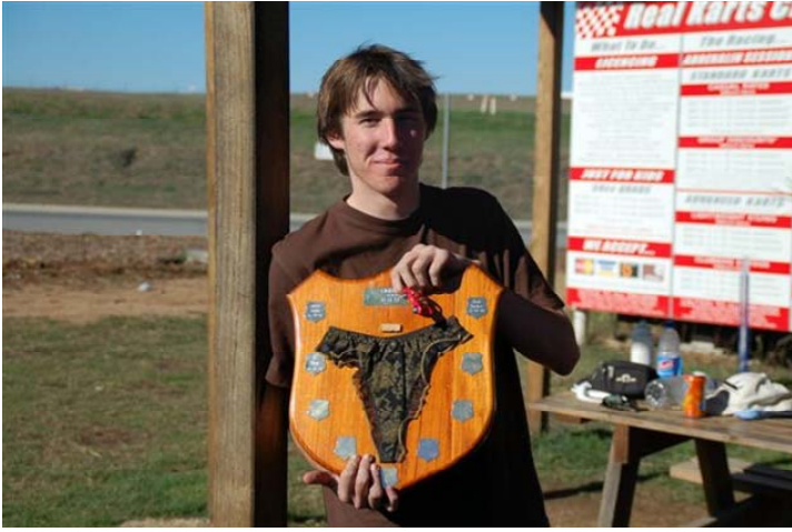
Bootlace - Winner of D Cup's Undie 300

ONE-STICK made her debut as the Hash Religious Adviser. She made her 1 st mistake by asking the previous Religious Advisers LOST AND FOUND and XXXX for advice, then made her 2 nd by thinking. She kept it short and sweet by asking of the crowd why 'the person previously known as BILL' has a spouse called DISAPPOINTED. To everyone's astonishment ONE-STICK advised that it must be because he is a quick f*ck. So 'QUICK F*CK' he is. A good name as agreed by all, and many were quick to shorten him to QUICKIE. Some females in the crowd were heard to say that they preferred this length of intimacy with their